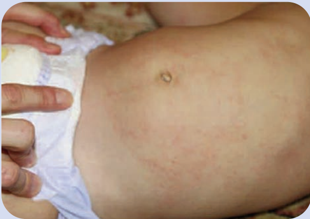
FIG. 1 Abdomen before therapy

Enclosed are the following photos that reveal the remarkable change in the patient's skin. Notice the change from dermatitis occurring from the abdomen ( FIGS. 1, 2 ), back ( FIGS. 3, 4 ) and face ( FIGS. 5, 6 ) to no rash at all. To date, the parents have not had any return of symptomatology. Once again proving the benefits of using the PRM to address drainage and detoxification functions of the dermis by and the regulating effects of the gut. ■