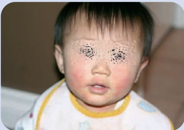
FIG. 5 Face before therapy