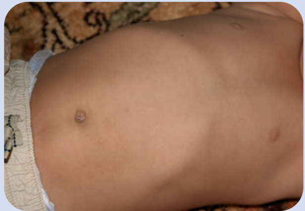
FIG. 2 Abdomen after therapy