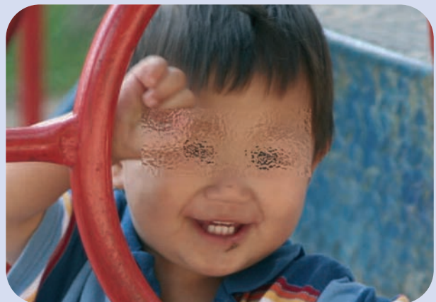
FIG. 6 Face after therapy